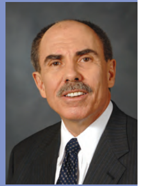
Bob Wise, President Alliance for Excellent Education

Brookland Conference Center 1066 Sunset Boulevard West Columbia, SC 29163